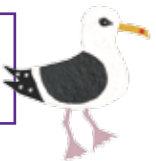
GREAT BLACK-BACKED GULL SKOMER ISLAND

Fact: These large seagulls can eat a rabbit whole!