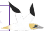
GANNET OFFSHORE - LOOK OUT FOR THEM FROM THE CLIFFTOPS

Fact: Gannets are the UK's largest seabird with a wingspan of up to 2m.